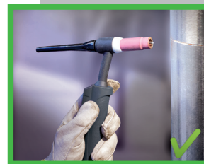
Clear shade 2