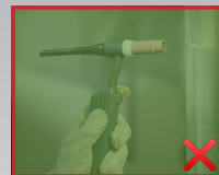
Clear shade 4