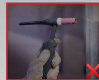
Clear shade 3